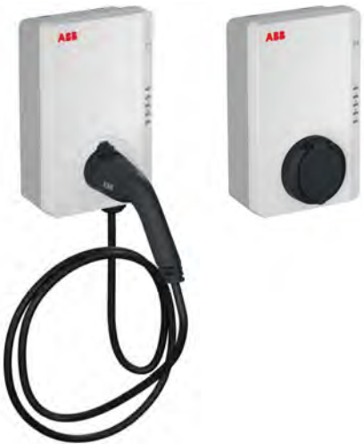
— 4.6 kW-22 kW Terra AC wallbox