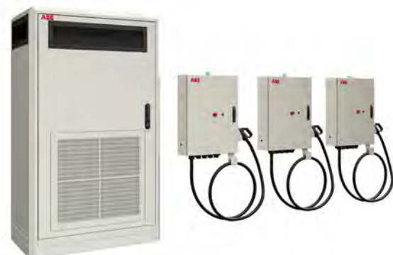
HVC-150C with 150 kW power cabinet and three depot charge boxes with sequential charging