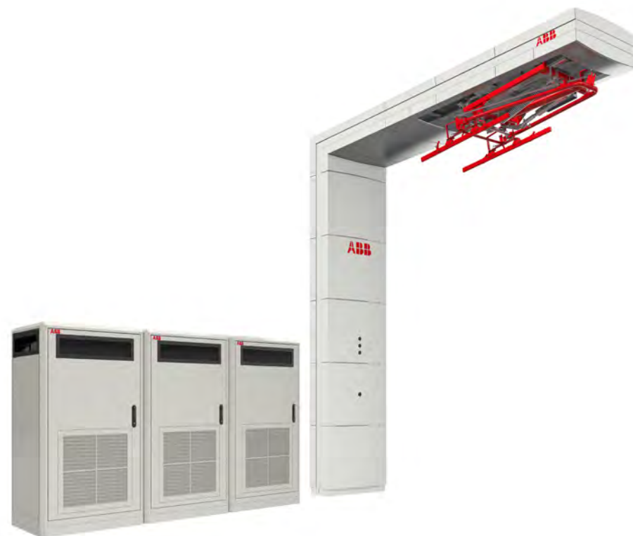
HVC-450PD with 450 kW power cabinet and standard charge pole