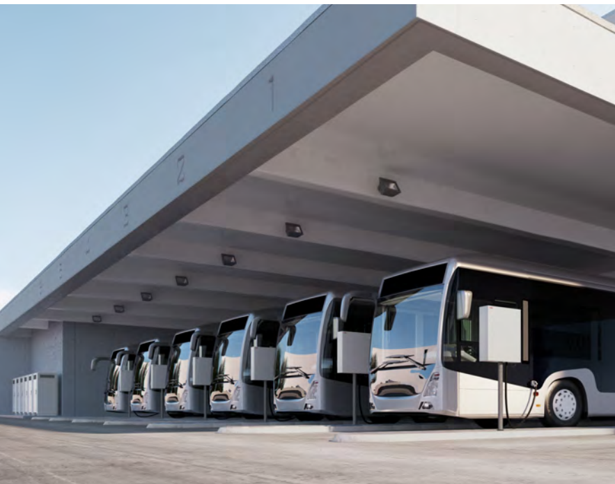
ABB offers a complete portfolio for charging heavy electric vehicles such as buses and trucks with a CCS connector. Due their large voltage range the DC wall box (24 kW) and Terra 54HV (50 kW) are perfectly suited to charge electric buses and trucks. For higher power the products with 100 kW and 150 kW including sequential charging, are specially designed to charge larger fleets of electric vehicles in it its most optimized way.

Charge electric buses and trucks with a connector