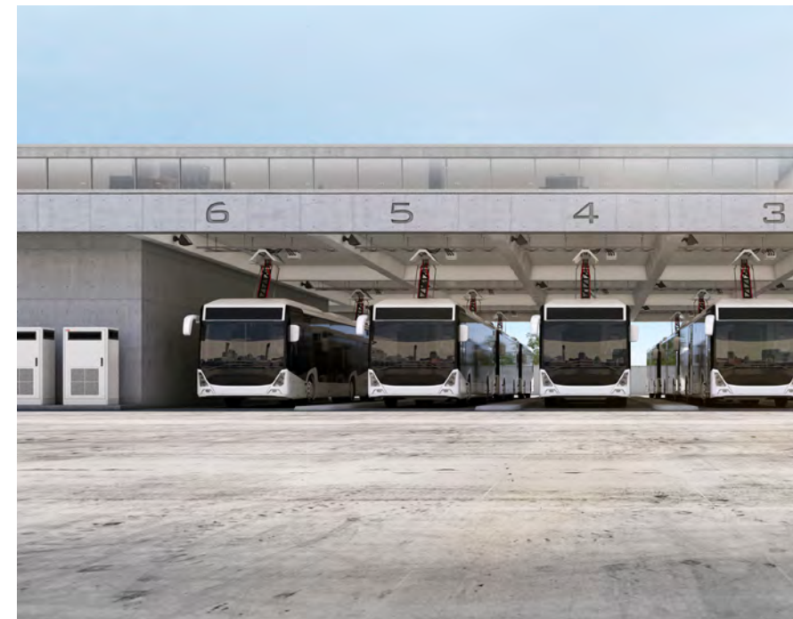
ABB offers an ideal solution to charge electric buses that are equipped with a roof mounted pantograph. This allows to charge larger fleets of electric buses overnight in a range of 50-150 kW per vehicle and during the day with 150-600 kW for opportunity charging.

Charge electric buses with a roof mounted pantograph