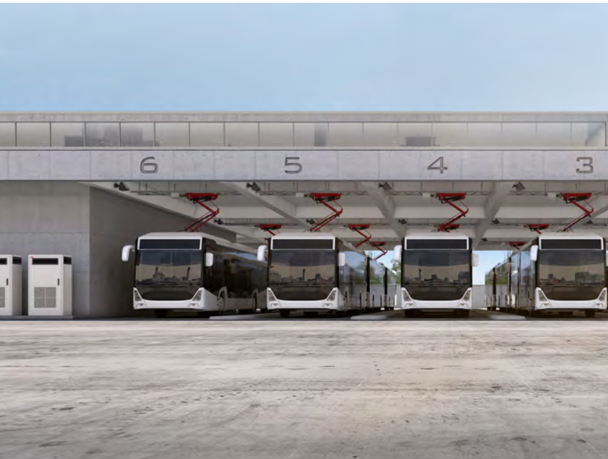
ABB offers an ideal solution to charge electric buses fully automated following the OppCharge protocol. With typical charge times of 3 to 6 minutes the system can easily be integrated in existing operations.

Charge electric buses following the OppCharge protocol