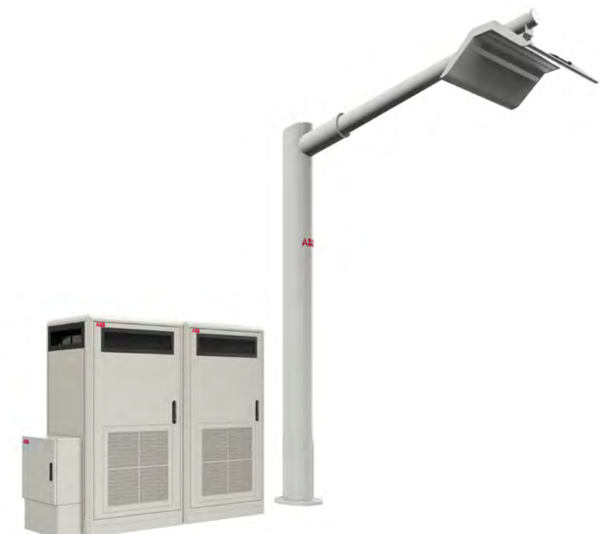
HVC-300PU with 300 kW power cabinet and slim design charge pole