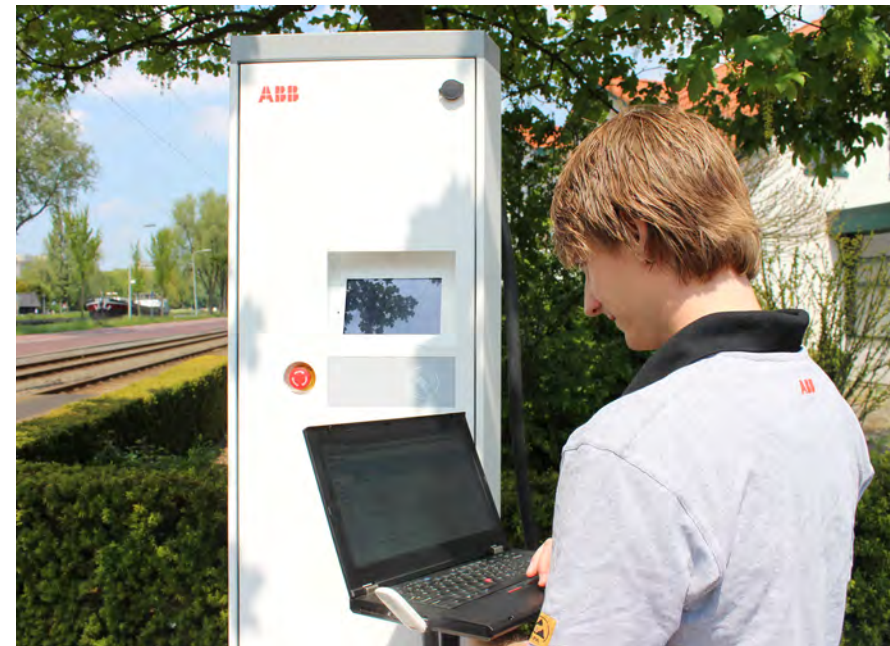
ABB Charger Care SLA

Benefit from ABB's experience and expertise servicing thousands of DC chargers and high power chargers up to 600 kW worldwide.